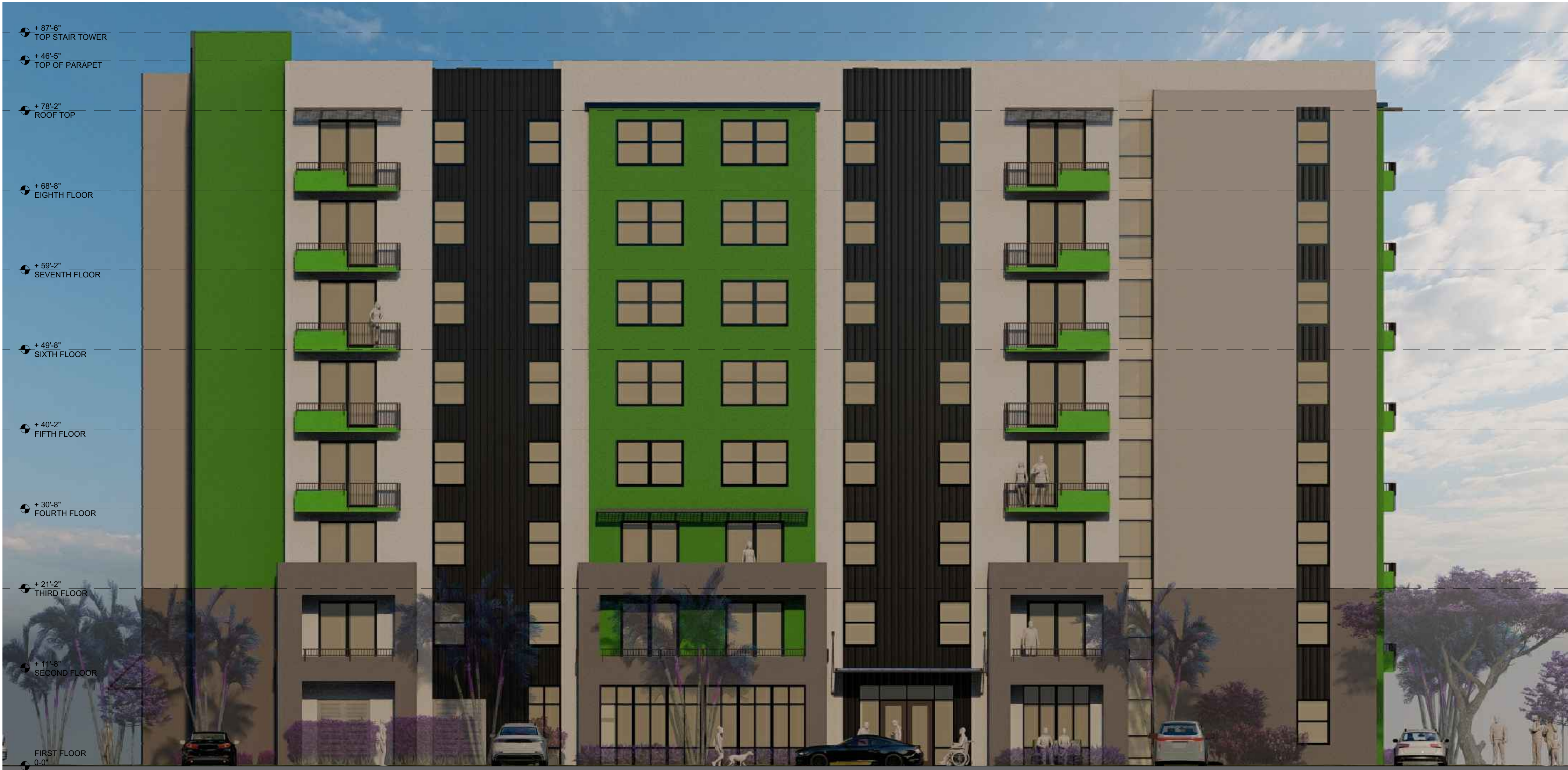
C1 ESAT ELEVATION 1/8" = 1'-0"

A VIOLATION OF THE LAW FOR ANY PERSON, UNLESS ACTING UNDER THE DIRECTION OF A LICENSED ARCHITECT, TO ALTER THESE PLANS OR SPECIFICATIONS. THIS DOCUMENT CONTAINS PROPRIETARY INFORMATION AND SHALL NOT BE USED OR REPRODUCED, IN WHOLE OR IN PART, WITHOUT THE PRIOR WRITTEN CONSENT OF GALLO HERBERT ARCHITECTS. (PROFESSIONAL SEAL REQUIRED) GALLO HERBERT ARCHITECTS SHALL BE PROMPTLY NOTIFIED BY THE DESIGNER OF ANY DISCREPANCIES. COPYRIGHT 2018 GALLO HERBERT ARCHITECTS